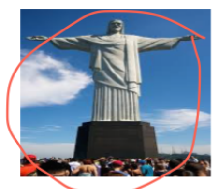
La statue du Cristo Redentor